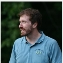
Teamwork Challenges By Dailey Chandler White Sulphur Springs

Tuesday September 29th At White Sulphur Springs